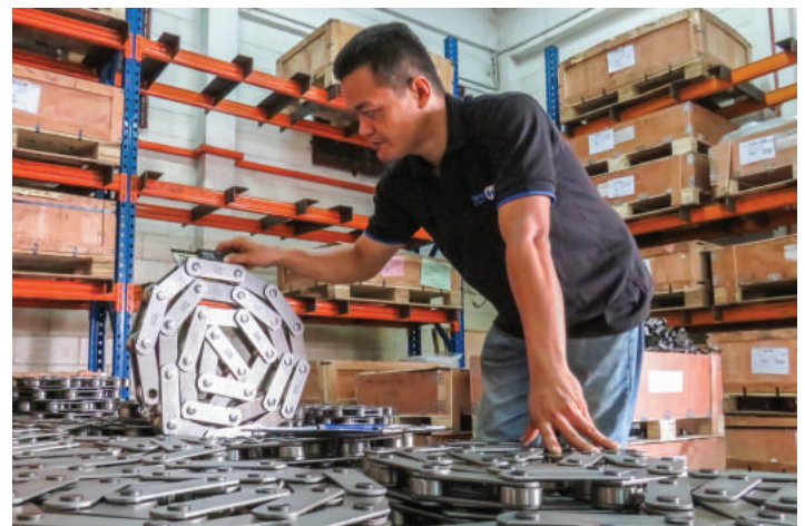
Our product line INSPECTION routines monitor quality through every stage of production, giving a CONSISTENTLY HIGH SPECIFICATION product.