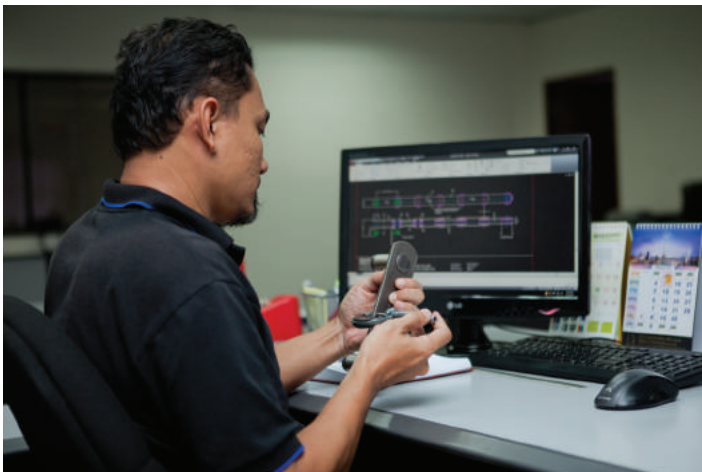
Our many years of experience enable us to DESIGN and manufacture a quality and reliable product.