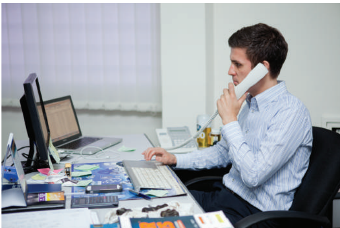
Our advice and SUPPORT gives you peace of mind, knowing that we are backing you up on your journey to success.