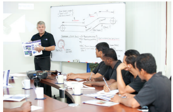
Our policy is to give the BEST AFTER SALES SERVICE by providing full on site TRAINING for all engineering staff, helping you to MAXIMISE PRODUCT LIFE .