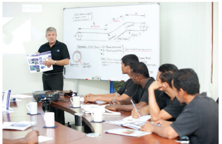
Our policy is to give the BEST AFTER SALES SERVICE by providing full on site TRAINING for all engineering staff, helping you to MAXIMISE PRODUCT LIFE .