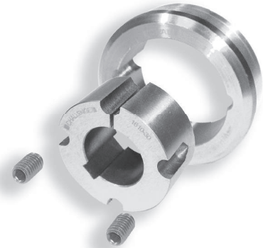
Taper Bush Shaft Fixings