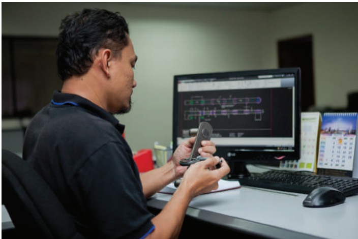
Our many years of experience enable us to DESIGN and manufacture a quality and reliable product.