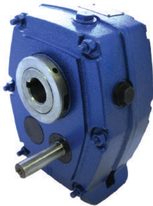
Shaft Mounted Speed Reducers