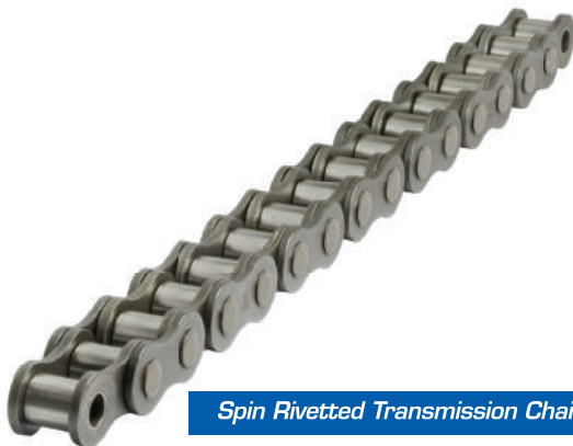
Spin Rivetted Transmission Chain